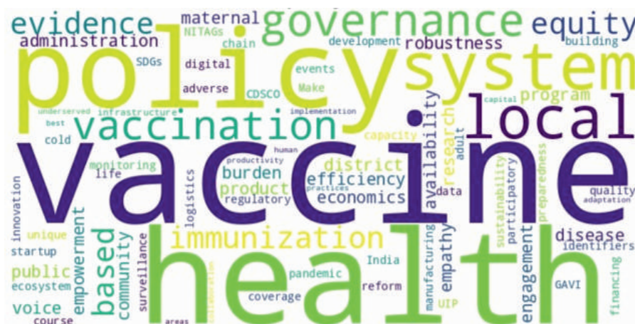
Figure 1. Word cloud based on discussion of the first session