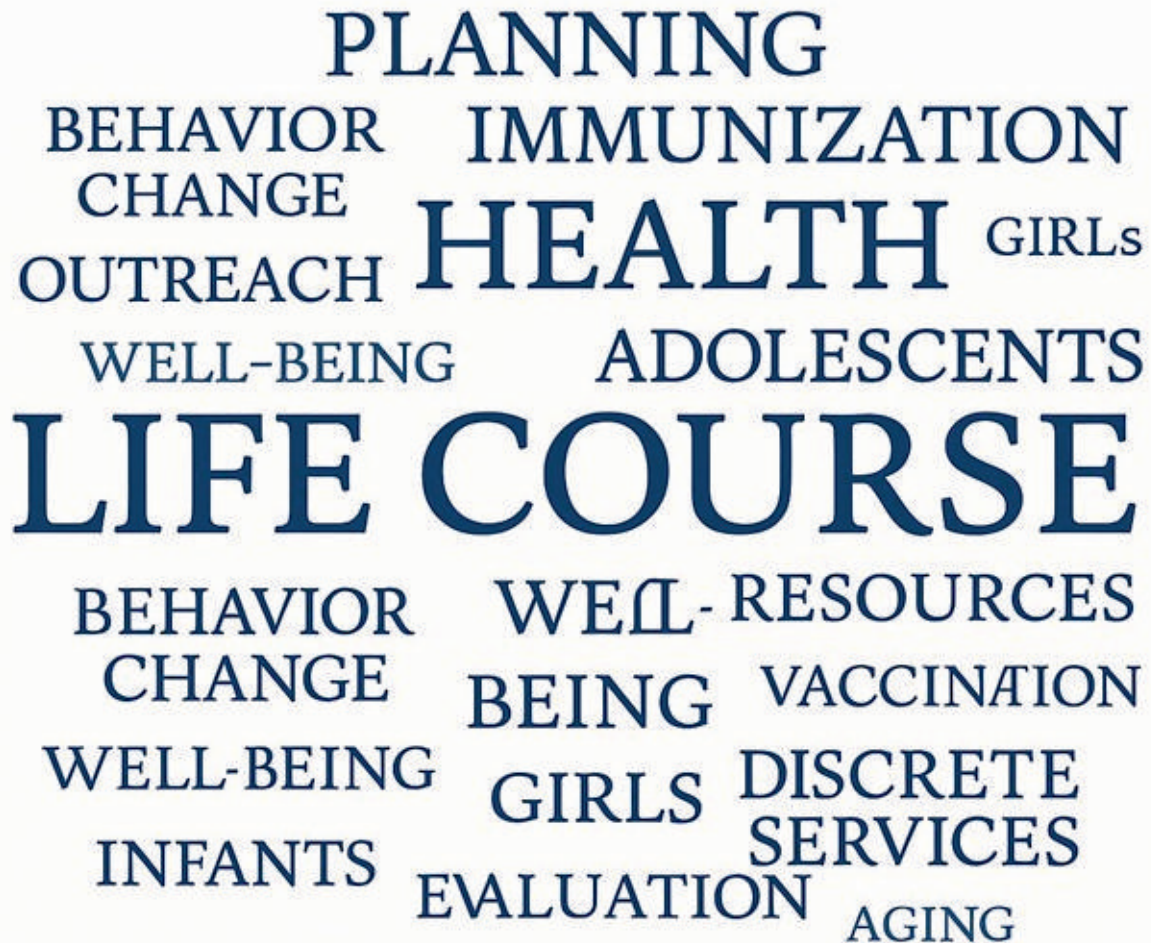
Figure 3. Word cloud based on the discussions of the third session