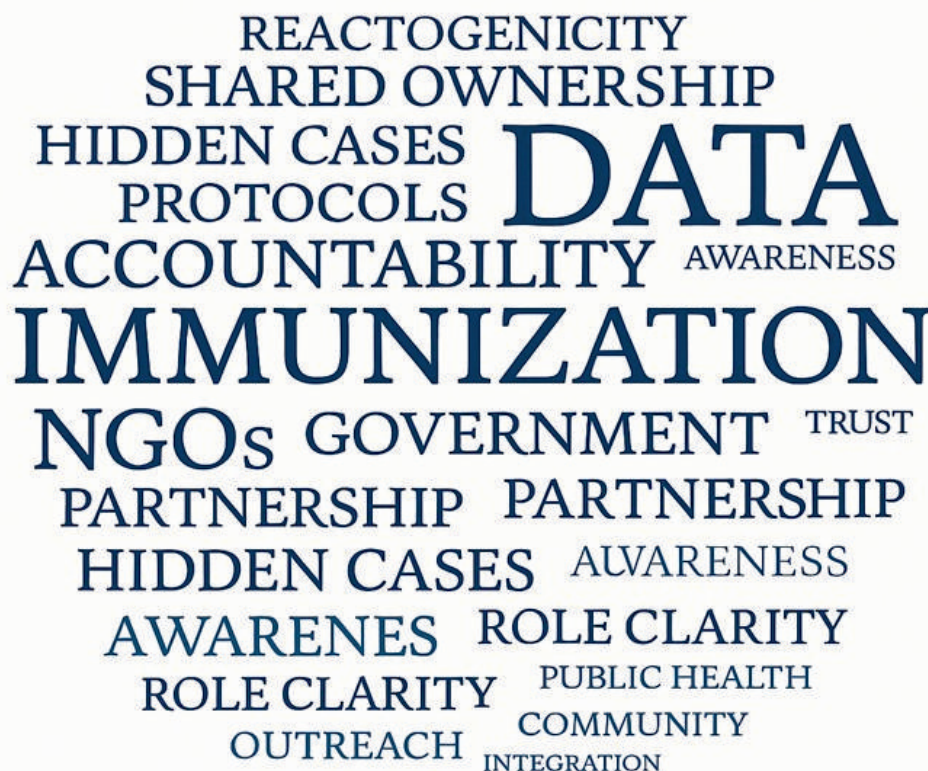
Figure 2. Word cloud based on discussions of the second session